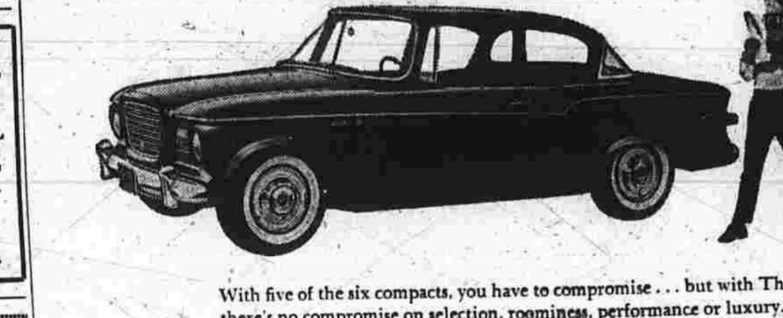
With five of the six compacts, you have to compromise... but with The Lark, there's no compromise on selection, roominess, performance or luxury.

MANY REASONS... There are many reasons for this choice, but the primary one is that The Lark will do anything and go anywhere the larger cars will, at a lower cost... The Lark is styled for both today and tomorrow, and engineered for hard, economical use.